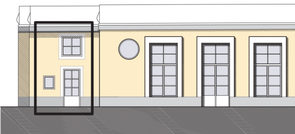
WINDOWS AND WINDOW DOOR ON WESTERN FACADE